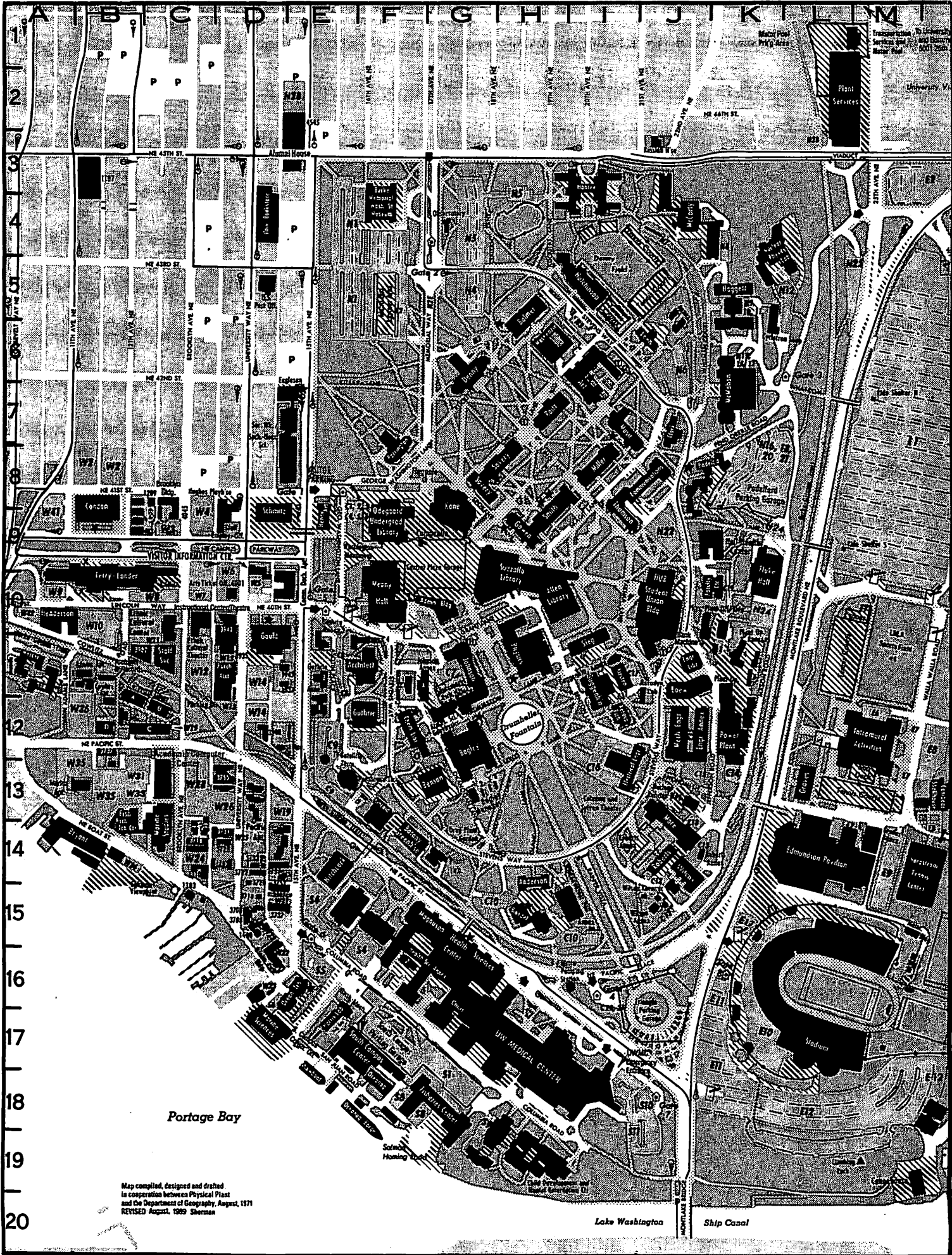
Map compiled, designed and drafted in cooperation between Physical Plant and the Department of Geography, August, 1971 REVISED August, 1989 Sherman