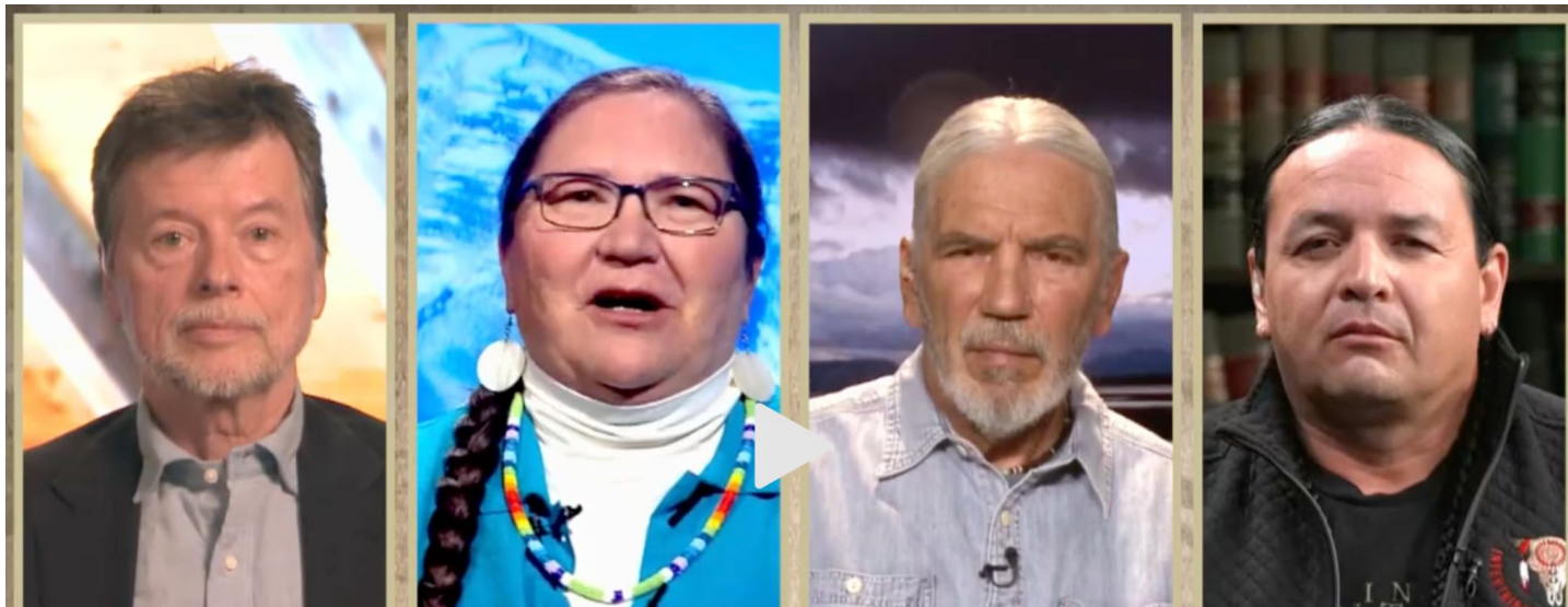
Ken Burns Filmmaker