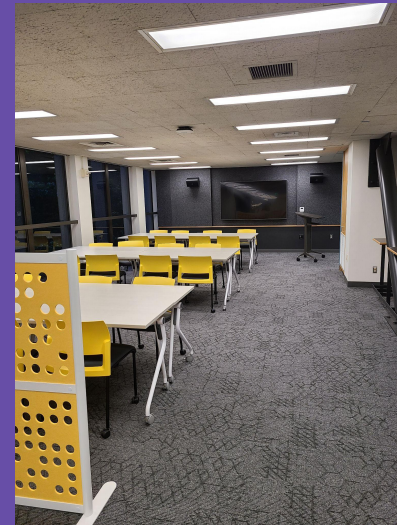
New Open Scholarship Commons Space, Suzzallo Library 1st Floor