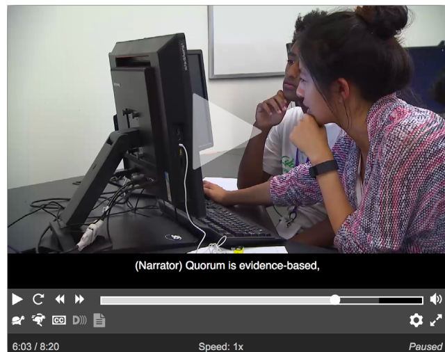
A screenshot in Able Player of the video Quorum: An Accessible Programming Language

It is the only media player that supports all five kinds of <track> elements, introduced in HTML5 to provide a means of synchronizing text with media during playback. The five