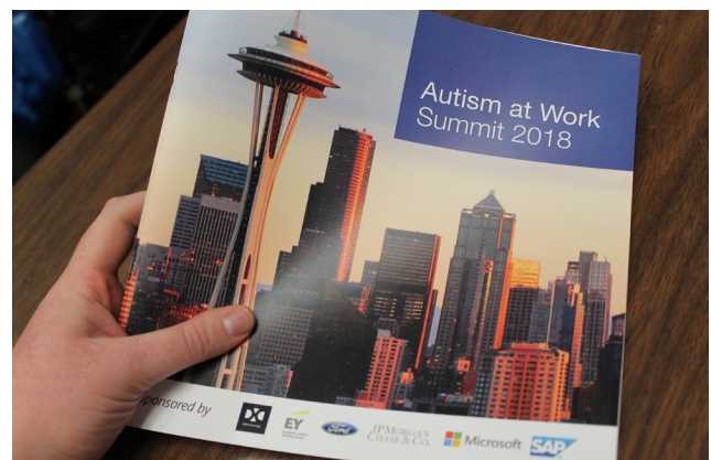
Autism at Work Summit 2018 program