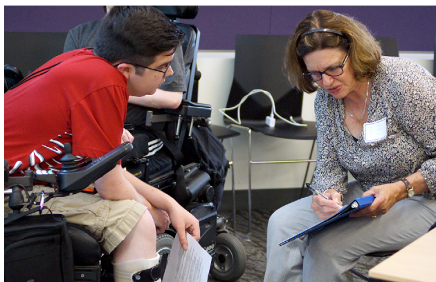
An AccessComputing participant works with a faculty member to improve their resume.

In order for students to use the Resume Database, they must first join the AccessComputing Team, a community of high school and college students with disabilities who are interested in computing fields. It's free to join, and Team membership has many