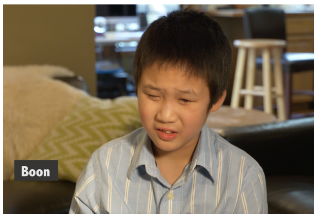
A screenshot of the AccessCSforAll 2018 STEM for All Video Showcase submission