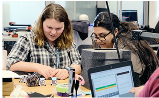
OurCS@UW+AccessComputing brought together students and mentors in an interactive research-focused workshop on UW campus.