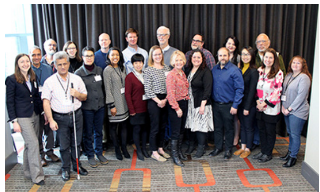
AccessCyberlearning participants from across the US came together to discuss accessible online learning methods.

The white paper stems out of a capacity building institute (CBI) hosted in January, which brought together researchers, graduate students, and leaders in NSF-funded cyberlearning projects to engage with each other and explore how to make digital learning research, products, activities, and resources welcoming to, accessible to, and usable by everyone, including those with disabilities.