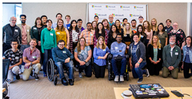
SASV participants interacted with industry and academic mentors over the course of the program.