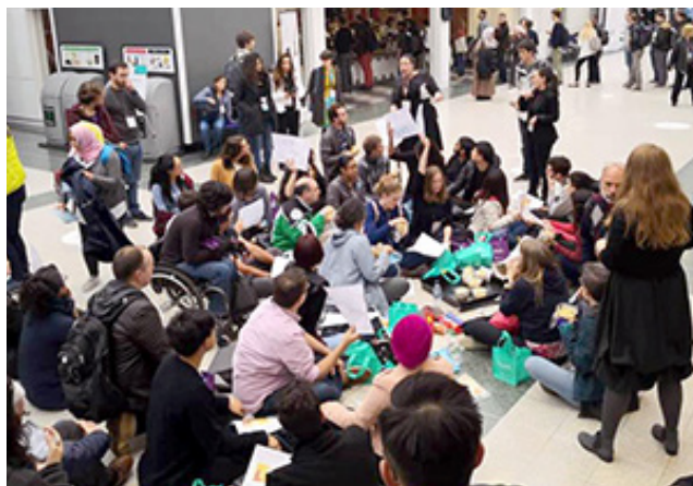
Protestors at the Crip-In at SIGCHI 2019 in Glasgow

For updates on SIGCHI accessibility please visit the AccessSIGCHI facebook page at www.facebook.com/groups/SIGCHIaccess/ .