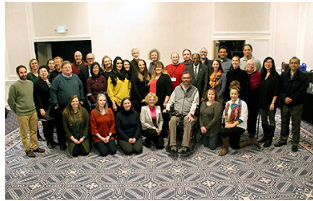
Participants from the March AccessINCLUDES CBI represented many INCLUDES projects from across the US.

AccessComputing's video on the STEM for All Video Showcase website.