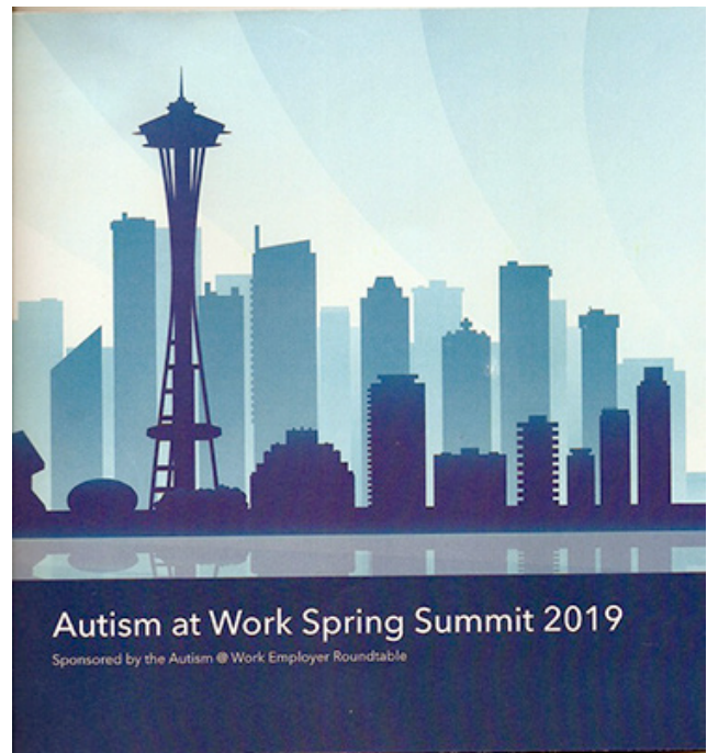
Autism at Work Spring Summit 2019

There were a number of panels and breakout sessions representing employers, employee support people, researchers, and advocates with autism. Employers talked about their autism hiring programs. Individuals who support employees talked about their work in helping companies do a good job of managing a diverse workforce and about their work as job coaches for employees with autism. Researchers talked about the many research problems that need to be studied to inform the