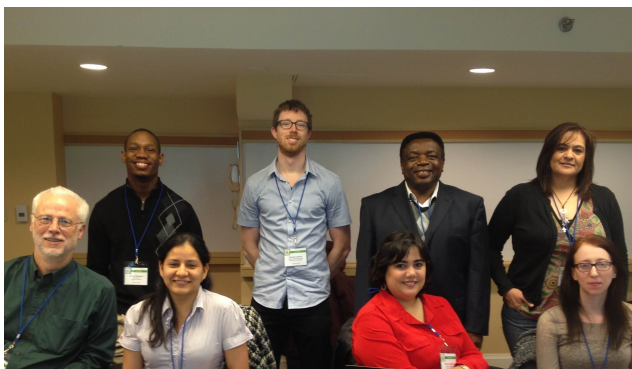
Participants and mentors at the 2019 Academic Careers Workshop

After a one year hiatus, the Academic Careers Workshop (ACW), sponsored by the Center for Minorities and People with Disabilities (CMD-IT), was held on May 16-19, 2019 in Houston, TX. There were 18 participants who attended, including four people with disabilities. The workshop is for senior graduate students and postdocs soon to be on the academic job market, as well as junior faculty members who are just beginning their academic careers. Experienced mentors provide talks, panels, and working groups on grant writing, effective teaching, leadership, and other topics leading toward advancement in academia. AccessComputing has been part of the organizing team for the workshop since 2010.