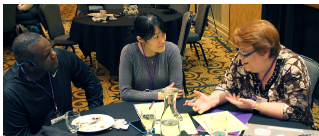
Attendees go over discussion questions at the AccessComputing CBI.

The CBI also facilitated a space for discussion among participants. Through discussing topics such as challenges in increasing the participation of students with disabilities in computing and strategies to increase accessibility content in computing curriculum, participants were able to make tangible plans they can implement at their own institutions. To learn more, view the proceedings when they are released at www.uw.edu/accesscomputing/resources/capacity-building-institutes .