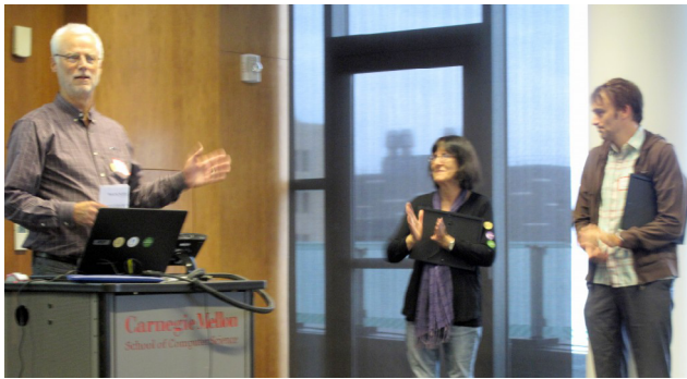
AccessComputing PI presents during the Capacity Building for Accessibility Event.

The afternoon was a showcase of accessibility research going on in CMU's School of Computer Science. The talks ranged from "Assistive Wheelchair-Mounted Robot Arms" to a "Cognitive Navigation Assistant for People with Visual Impairments or Blindness." A recent development at CMU has been our campus-wide Bias Busters program, which aims to promote awareness and discussion on unconscious bias. We are fortunate to have an expert in this field among our faculty; in a talk titled Exploring Individual and Community-Level Approaches for Mitigating Unconscious Bias, he discussed how unconscious bias relate to people with disabilities.