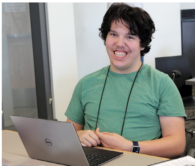
Learning about accessibility in computing courses leads to the creation of more accessible products.

At the ACM Special Interest Group on Computer Science Education (SIGCSE) Conference that will be held in Seattle, March 8-11, 2017, Richard Ladner and Matt May from Adobe Corporation will be presenting a special session titled “Teaching Accessibility.” A major part of the special session will present content about accessibility that can be included in many courses that stress application and/or web development.