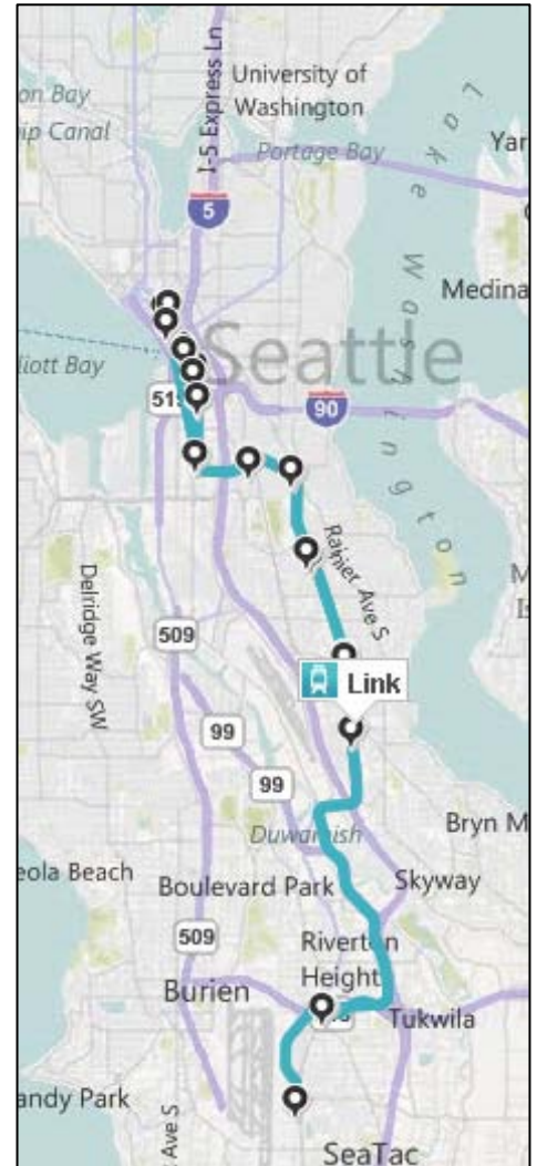
Light rail route north from SeaTac to downtown.

Watertown Hotel 4242 Roosevelt Way NE, Seattle, WA 98105 1-866-866-7977 www.watertownseattle.com