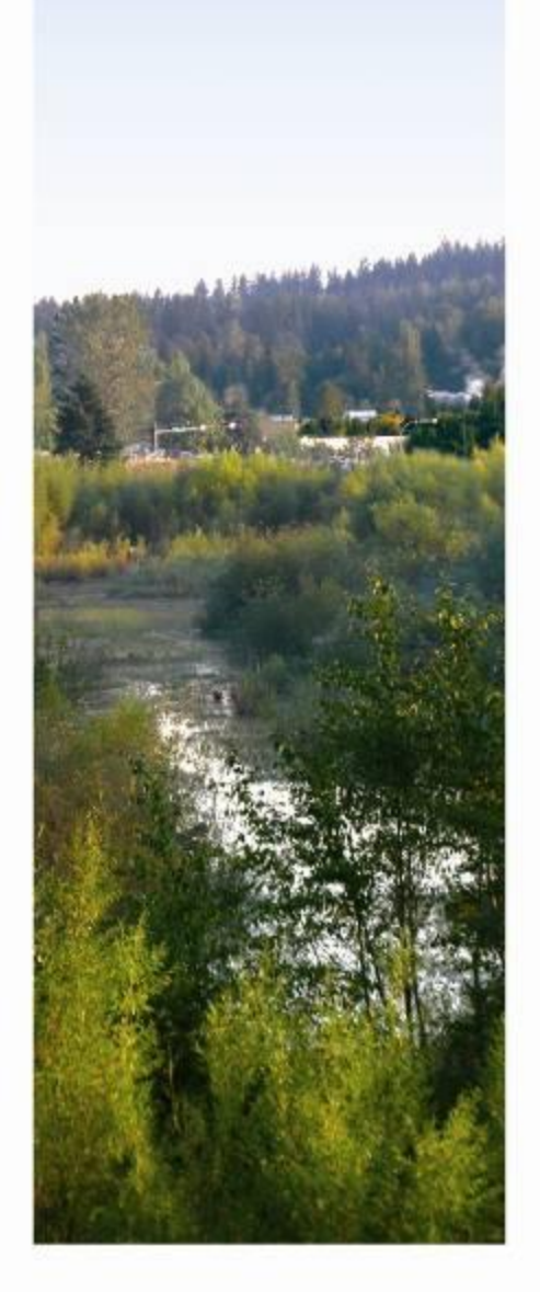
Master Plan Update