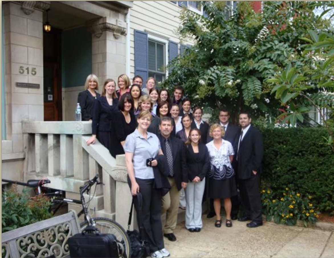
515 East Capital Street