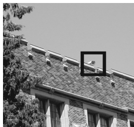
(a) The HDTV Camera