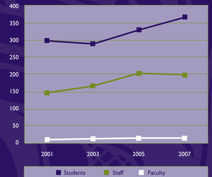
DISTRIBUTION OF NATIVE AMERICAN STUDENTS (SEATTLE), FACULTY (SEATTLE) AND STAFF (ALL CAMPUSES) AT THE UW 2001 TO 2007

Sources: UW Equal Opportunity Office & Student Database Prepared by: Office of Minority Affairs and Diversity, March 11, 2008