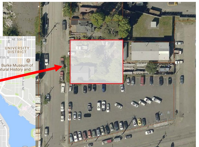
3814 4th Ave NE property.

For more information visit: seattle.gov/homelessness