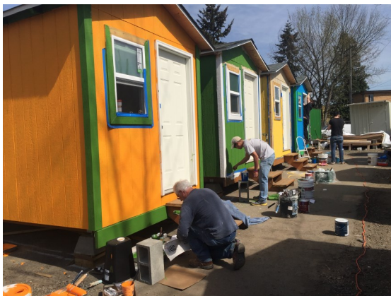
Volunteers prepare tiny houses for the Othello permitted encampment.