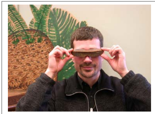
Arctic Snow goggles!