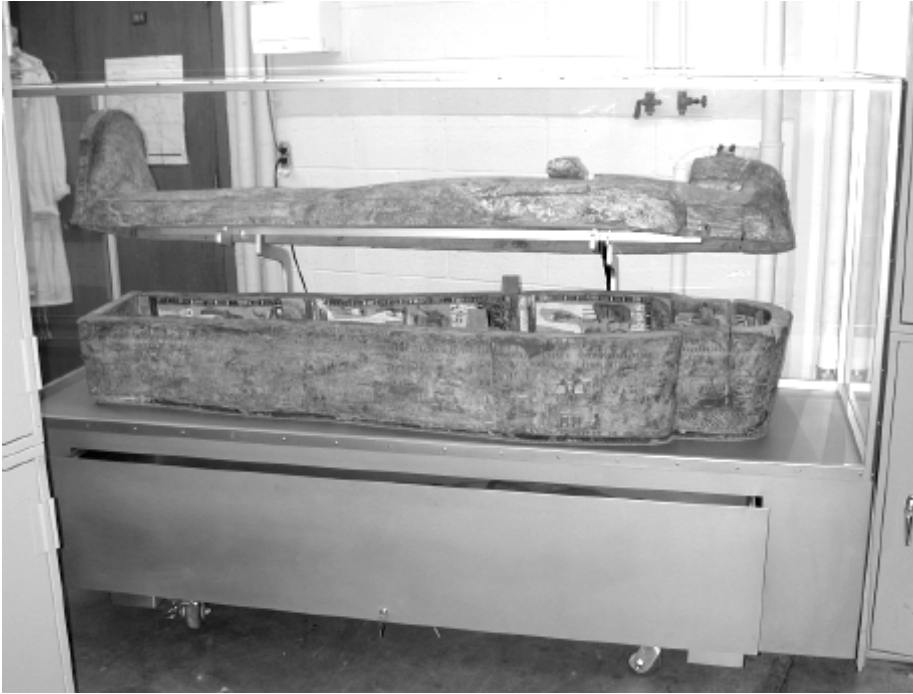
3,000 year old Egyptian coffin in new state-of-the-art case

Work is nearly completed on the revival of the Burke's Egyptian mummy and coffin. Snow and Company has completed the construction of a new storage and exhibition case system. This case includes cutting-edge technology in microclimate control and monitoring, and a fiber-optic lighting system. It will help preserve these objects of great antiquity from deterioration in Seattle's climate.